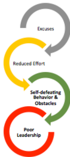
Figure 2. Excuse-Reduced Effort-Obstacle (ERO) Spiral

The reason leaders can get stuck in this vicious cycle is due to three possibilities: 1) it is difficult to admit one’s self-defeating behavior, 2) it is a habit that is reinforced, or 3) the individual has suppressed knowledge of their behavior and is in denial.