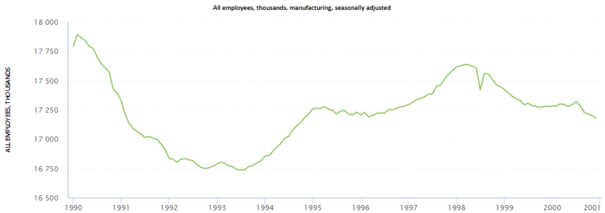
Figure: U.S. Employment in Manufacturing 1990-2000

Opponents of global outsourcing argue that this activity leads to layoffs and dislocation of thousands of workers and reduce the quality of services provided. For example, The Nobel Prize laureate, Economist Paul Samuelson argues that the U.S. National income would be affected negatively if countries like China and India achieve higher productivity in exports. Also, in 2004 Senator John Kerry claimed that 3 million U.S. jobs been lost because of international outsourcing.